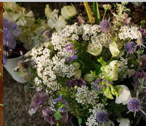
PASTELS WITH WHITE