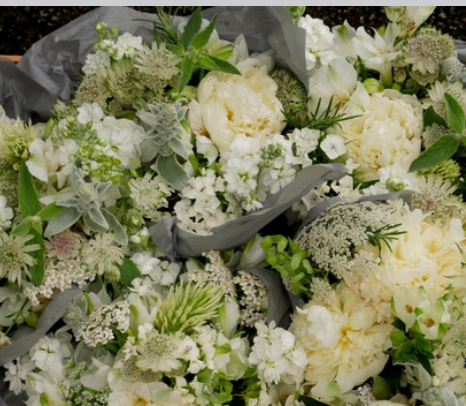
GREEN AND WHITE

First think about your colour palette. Eg. white and green, pinks, pastels, blue purple and white, autumn hues. There's some examples below.....You might be thinking you just want the whole garden – a mix of everything, that's fine too!